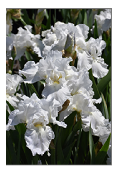
Immortality Iris flowers

Immortality Iris features bold white flag-like flowers with a buttery yellow beard at the ends of the stems in mid spring. The flowers are excellent for cutting. Its sword-like leaves remain green in color throughout the season.