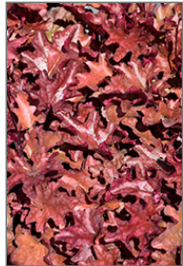
Peach Flambe Coral Bells foliage

This is a relatively low maintenance plant, and should be cut back in late fall in preparation for winter. It is a good choice for attracting hummingbirds to your yard. It has no significant negative characteristics.