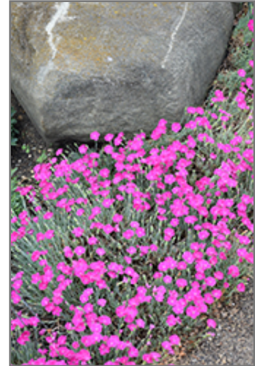
Firewitch Pinks in bloom

Firewitch Pinks is a fine choice for the garden, but it is also a good selection for planting in outdoor pots and containers. It is often used as a 'filler' in the 'spiller-thriller-filler' container combination, providing a mass of flowers and foliage against which the thriller plants stand out. Note that when growing plants in outdoor containers and baskets, they may require more frequent waterings than they would in the yard or garden.