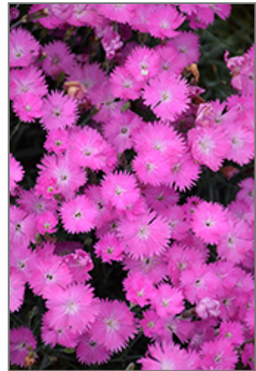
Firewitch Pinks flowers

Firewitch Pinks is recommended for the following landscape applications;