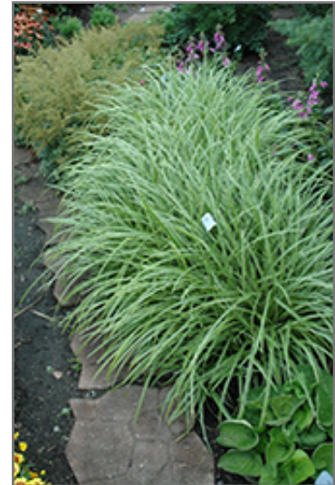
Ice Dance Sedge