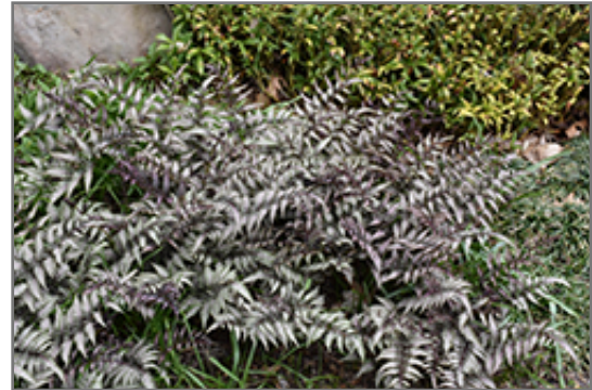
Pewter Lace Painted Fern