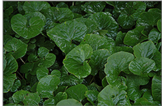
Canadian Wild Ginger