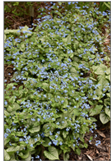
Jack Frost Bugloss in bloom

Jack Frost Bugloss is a fine choice for the garden, but it is also a good selection for planting in outdoor pots and containers. It is often used as a 'filler' in the 'spiller-thriller-filler' container combination, providing a mass of flowers and foliage against which the thriller plants stand out. Note that when growing plants in outdoor containers and baskets, they may require more frequent waterings than they would in the yard or garden.