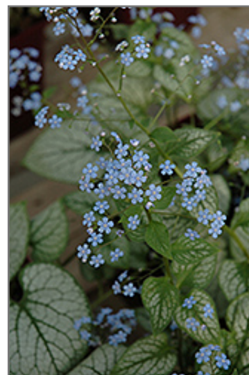
Jack Frost Bugloss flowers