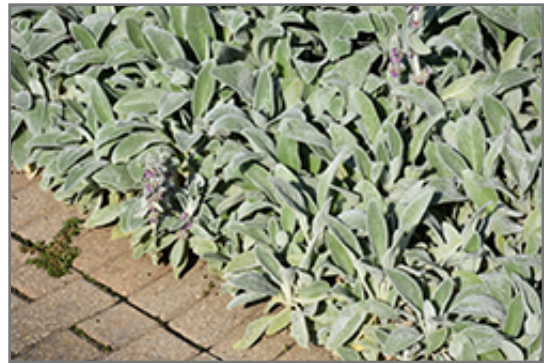
Lamb's Ears

Lamb's Ears will grow to be about 12 inches tall at maturity extending to 24 inches tall with the flowers, with a spread of 18 inches. When grown in masses or used as a bedding plant, individual plants should be spaced approximately 15 inches apart. Its foliage tends to remain dense right to the ground, not requiring facer plants in front. It grows at a fast rate, and under ideal conditions can be expected to live for approximately 10 years. As an herbaceous perennial, this plant will usually die back to the crown each winter, and will regrow from the base each spring. Be careful not to disturb the crown in late winter when it may not be readily seen!