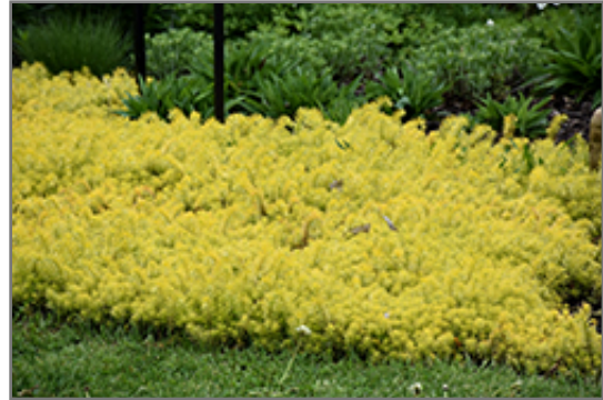
Angelina Stonecrop

This plant does best in full sun to partial shade. It prefers dry to average moisture levels with very well-drained soil, and will often die in standing water. It is considered to be drought-tolerant, and thus makes an ideal choice for a low-water garden or xeriscape application. It is not particular as to soil pH, but grows best in poor soils, and is able to handle environmental salt. It is highly tolerant of urban pollution and will even thrive in inner city environments. This is a selected variety of a species not originally from North America. It can be propagated by division; however, as a cultivated variety, be aware that it may be subject to certain restrictions or prohibitions on propagation.