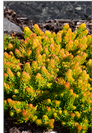
Angelina Stonecrop foliage