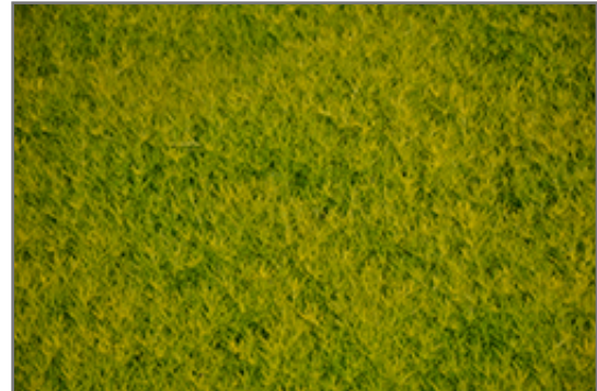
Scotch Moss foliage