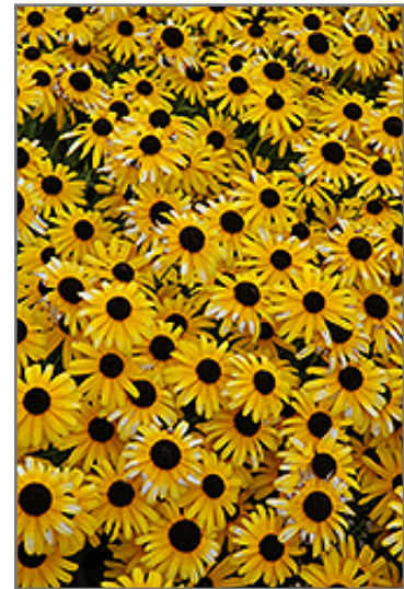
Viette's Little Suzy Coneflower flowers