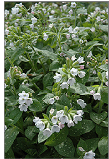
Sissinghurst White Lungwort flowers