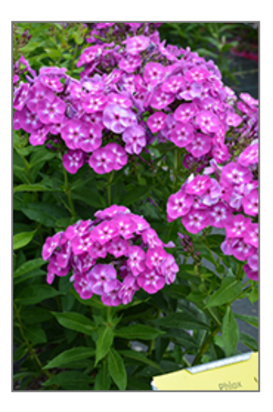
Laura Garden Phlox flowers

Laura Garden Phlox features bold fragrant conical lilac purple star-shaped flowers with white eyes at the ends of the stems from early summer to early fall. The flowers are excellent for cutting. Its narrow leaves remain green in color throughout the season.