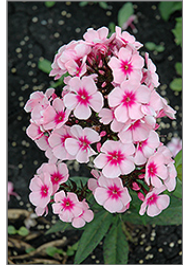
Bright Eyes Garden Phlox flowers

Bright Eyes Garden Phlox is a fine choice for the garden, but it is also a good selection for planting in outdoor pots and containers. With its upright habit of growth, it is best suited for use as a 'thriller' in the 'spiller-thriller-filler' container combination; plant it near the center of the pot, surrounded by smaller plants and those that spill over the edges. It is even sizeable enough that it can be grown alone in a suitable container. Note that when growing plants in outdoor containers and baskets, they may require more frequent waterings than they would in the yard or garden.