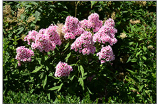
Bright Eyes Garden Phlox in bloom