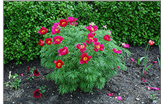
Fernleaf Peony in bloom