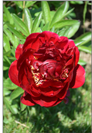
Buckeye Belle Peony flowers