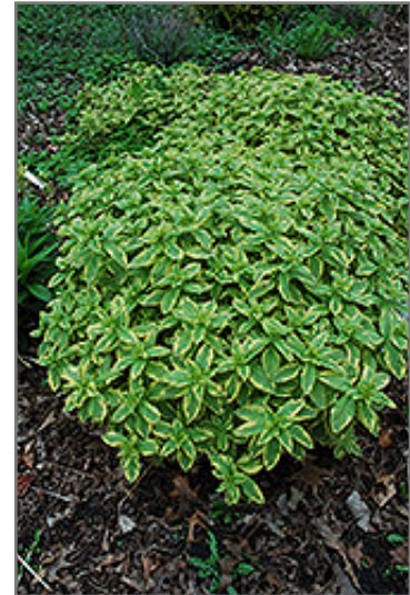
Golden Alexander Loosestrife