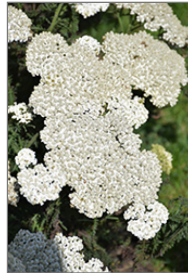
Firefly Diamond Yarrow flowers

Firefly Diamond Yarrow is recommended for the following landscape applications;