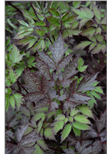
Black Negligee Bugbane foliage