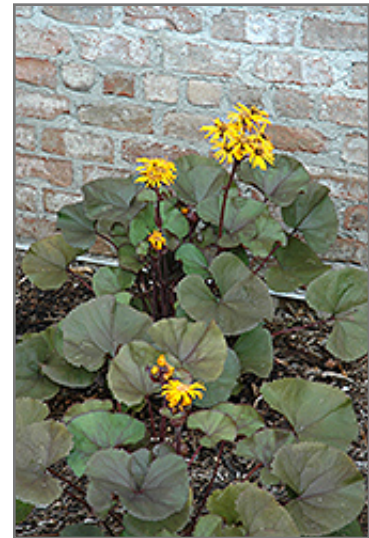
Britt Marie Crawford Rayflower in bloom