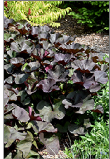
Britt Marie Crawford Rayflower foliage

This plant does best in partial shade to shade. It prefers to grow in moist to wet soil, and will even tolerate some standing water. It is not particular as to soil pH, but grows best in rich soils. It is somewhat tolerant of urban pollution. This is a selected variety of a species not originally from North America. It can be propagated by division; however, as a cultivated variety, be aware that it may be subject to certain restrictions or prohibitions on propagation.