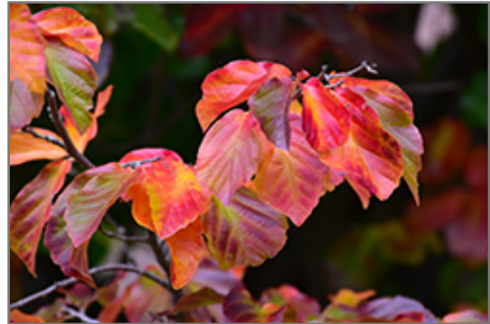
Persian Parrotia in fall