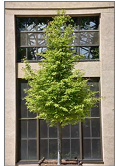
Persian Parrotia