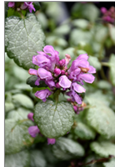
Red Nancy Spotted Dead Nettle flowers