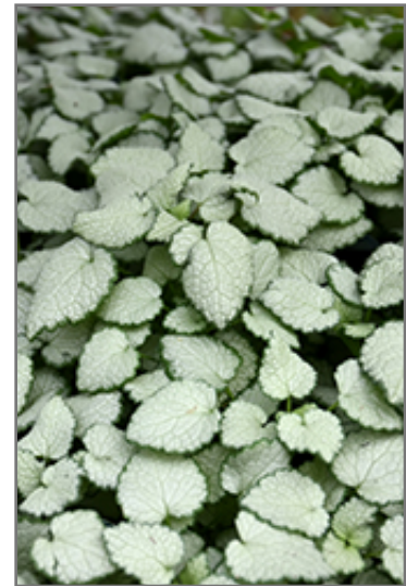
Red Nancy Spotted Dead Nettle foliage

Red Nancy Spotted Dead Nettle is a fine choice for the garden, but it is also a good selection for planting in outdoor pots and containers. Because of its spreading habit of growth, it is ideally suited for use as a 'spiller' in the 'spiller-thriller-filler' container combination; plant it near the edges where it can spill gracefully over the pot. Note that when growing plants in outdoor containers and baskets, they may require more frequent waterings than they would in the yard or garden.