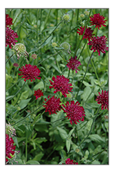
Crimson Scabious flowers

This plant does best in full sun to partial shade. It prefers to grow in average to dry locations, and dislikes excessive moisture. It is considered to be drought-tolerant, and thus makes an ideal choice for a low-water garden or xeriscape application. It is not particular as to soil type, but has a definite preference for alkaline soils. It is somewhat tolerant of urban pollution. This species is not originally from North America.