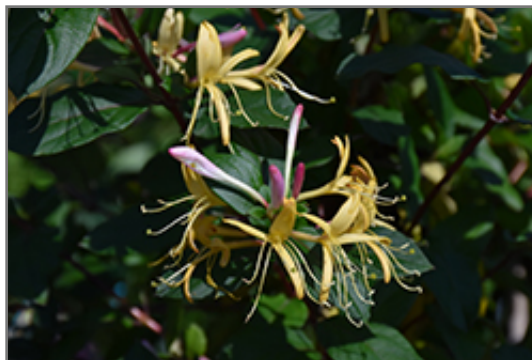
Purple-Leaf Japanese Honeysuckle flowers