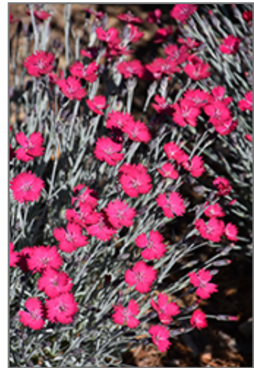
Wicked Witch Pinks flowers

Wicked Witch Pinks is a fine choice for the garden, but it is also a good selection for planting in outdoor pots and containers. It is often used as a 'filler' in the 'spiller-thriller-filler' container combination, providing a mass of flowers and foliage against which the thriller plants stand out. Note that when growing plants in outdoor containers and baskets, they may require more frequent waterings than they would in the yard or garden.