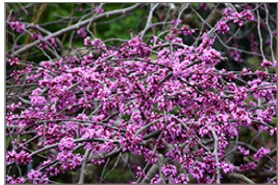
Traveller Weeping Redbud flowers