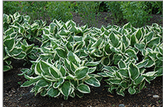
Minuteman Hosta