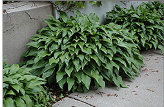
Invincible Hosta

Invincible Hosta is recommended for the following landscape applications;