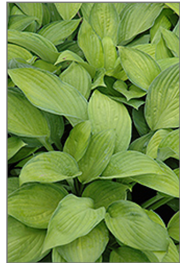
Gold Standard Hosta foliage

Gold Standard Hosta is recommended for the following landscape applications;