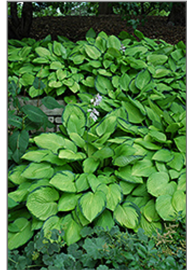
Gold Standard Hosta in bloom