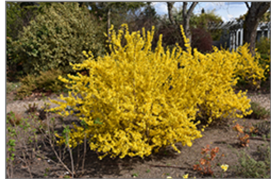
Magical Gold Forsythia in bloom