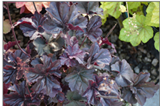
Obsidian Coral Bells foliage