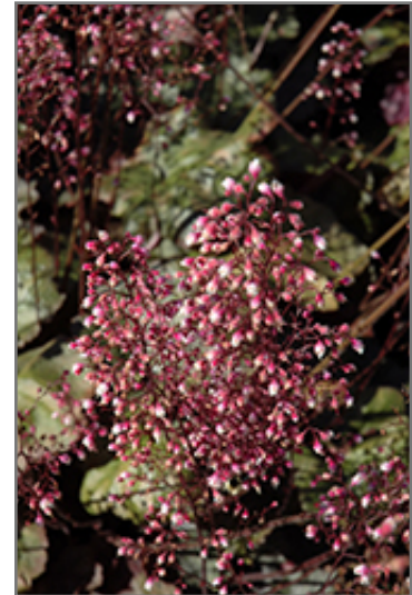
Frosted Violet Coral Bells flowers