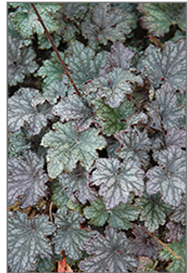
Frosted Violet Coral Bells foliage

This is a relatively low maintenance plant, and should be cut back in late fall in preparation for winter. It is a good choice for attracting hummingbirds to your yard. It has no significant negative characteristics.