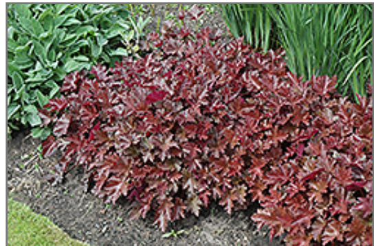
Chocolate Ruffles Coral Bells

Chocolate Ruffles Coral Bells is recommended for the following landscape applications;