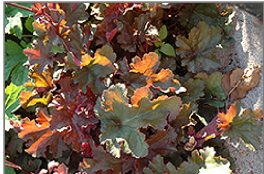
Chocolate Ruffles Coral Bells foliage

Chocolate Ruffles Coral Bells will grow to be about 10 inches tall at maturity extending to 24 inches tall with the flowers, with a spread of 12 inches. When grown in masses or used as a bedding plant, individual plants should be spaced approximately 10 inches apart. Its foliage tends to remain low and dense right to the ground. It grows at a medium rate, and under ideal conditions can be expected to live for approximately 10 years. As an evergreen perennial, this plant will typically keep its form and foliage year-round.