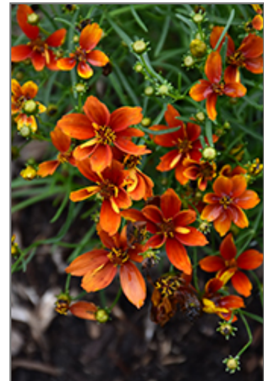
Sizzle And Spice Crazy Cayenne Tickseed flowers

Sizzle And Spice Crazy Cayenne Tickseed is recommended for the following landscape applications;