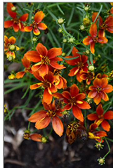
Sizzle And Spice Crazy Cayenne Tickseed flowers

Sizzle And Spice Crazy Cayenne Tickseed is recommended for the following landscape applications;