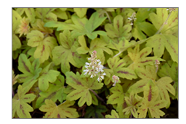
Sunrise Falls Foamy Bells flowers

This is a relatively low maintenance plant, and should be cut back in late fall in preparation for winter. It is a good choice for attracting hummingbirds to your yard. It has no significant negative characteristics.