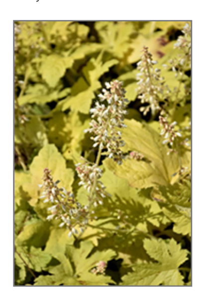
Sunrise Falls Foamy Bells flowers

Sunrise Falls Foamy Bells is recommended for the following landscape applications;