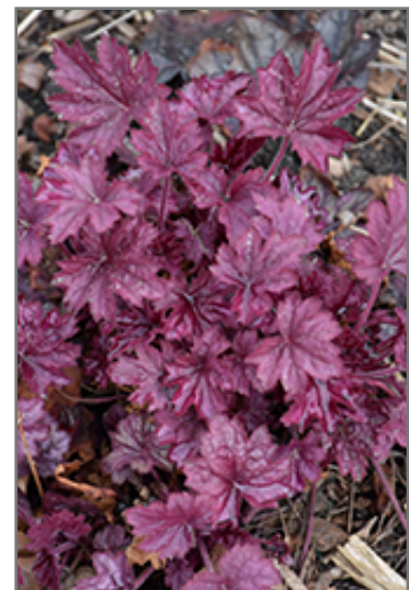
Wild Rose Coral Bells foliage