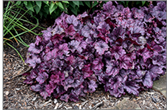
Wild Rose Coral Bells

This is a relatively low maintenance plant, and should be cut back in late fall in preparation for winter. It is a good choice for attracting hummingbirds to your yard. It has no significant negative characteristics.