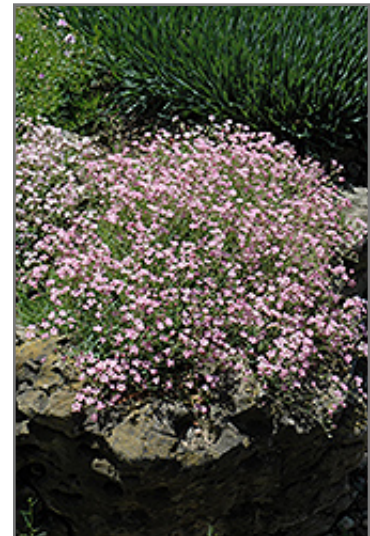
Pink Creeping Baby's Breath in bloom