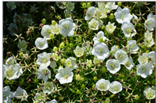
Rapido White Bellflower flowers