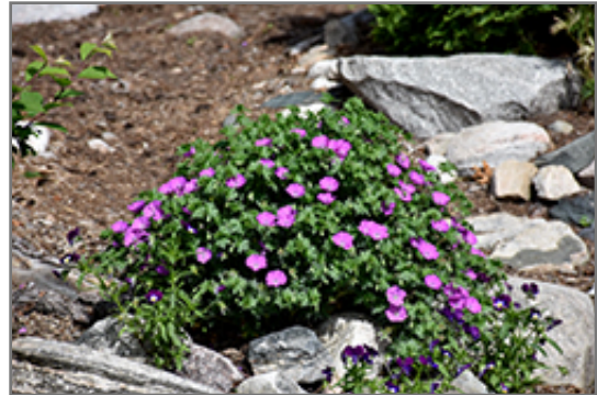
Bloody Cranesbill in bloom