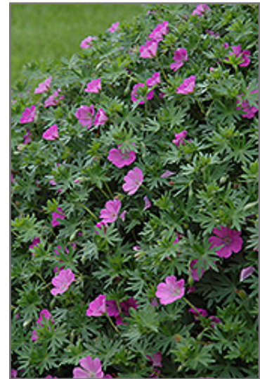
Bloody Cranesbill flowers