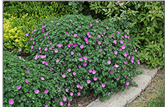
Bloody Cranesbill in bloom