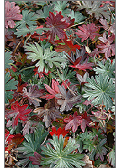
Bloody Cranesbill in fall

Bloody Cranesbill is a fine choice for the garden, but it is also a good selection for planting in outdoor pots and containers. It is often used as a 'filler' in the 'spiller-thriller-filler' container combination, providing a mass of flowers against which the thriller plants stand out. Note that when growing plants in outdoor containers and baskets, they may require more frequent waterings than they would in the yard or garden.