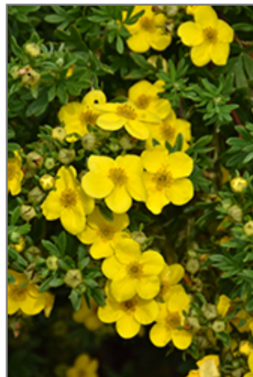
Happy Face Yellow Potentilla flowers