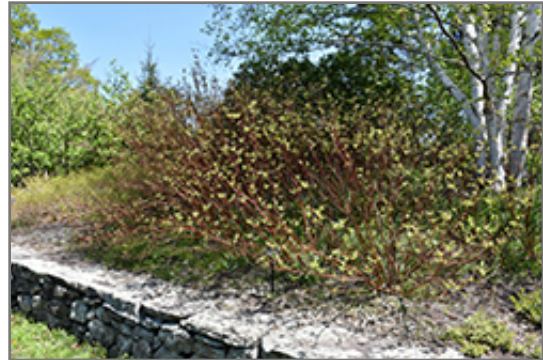
Bailey's Red Twig Dogwood in spring