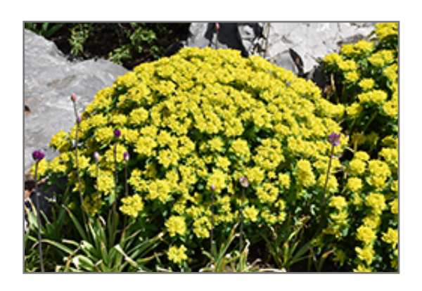
Cushion Spurge in bloom

This is a relatively low maintenance plant, and should only be pruned after flowering to avoid removing any of the current season's flowers. Deer don't particularly care for this plant and will usually leave it alone in favor of tastier treats. Gardeners should be aware of the following characteristic(s) that may warrant special consideration;