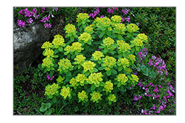
Cushion Spurge in bloom

Cushion Spurge is an herbaceous perennial with a mounded form. Its medium texture blends into the garden, but can always be balanced by a couple of finer or coarser plants for an effective composition.