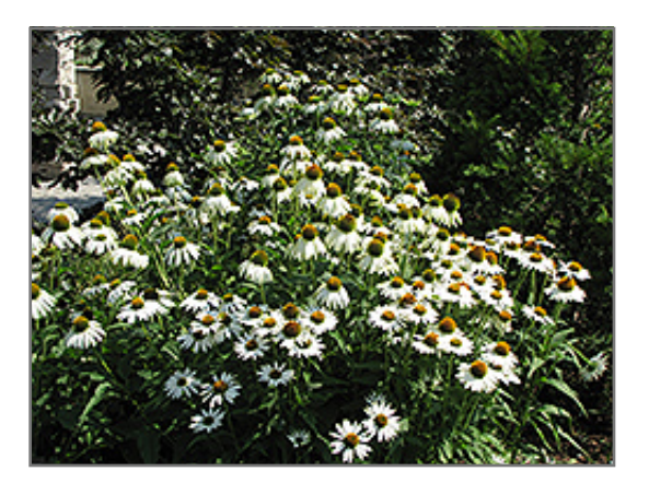
White Swan Coneflower in bloom