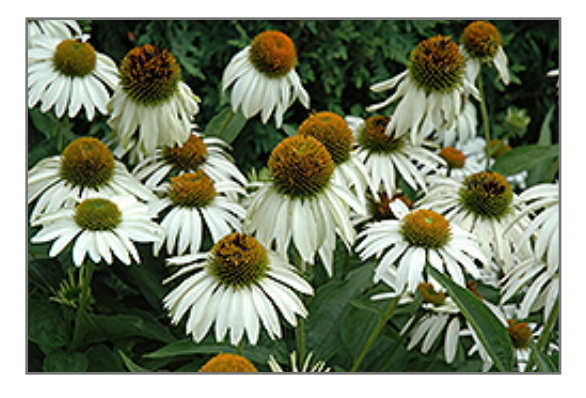
White Swan Coneflower flowers

White Swan Coneflower is recommended for the following landscape applications;