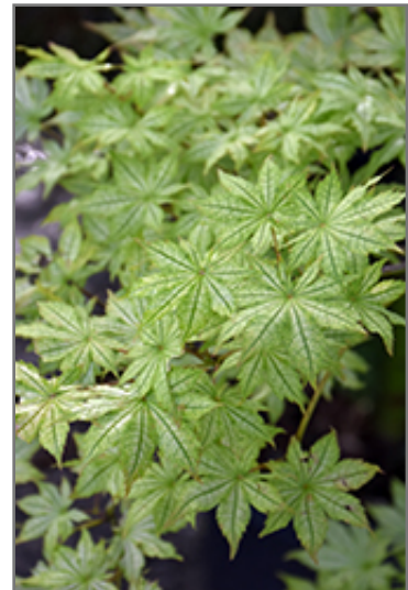
Shigitatsu Sawa Japanese Maple foliage