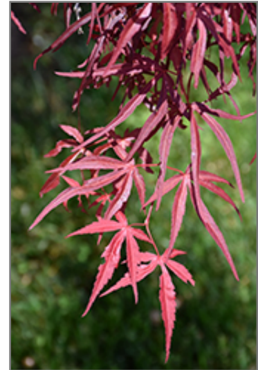
Red Spider Japanese Maple foliage