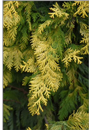
Cripps Gold Falsecypress foliage