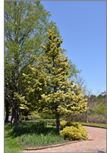
Cripps Gold Falsecypress

This plant is not reliably hardy in our region, and is therefore not covered under our warranty.