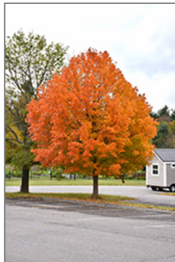
Sugar Maple in fall