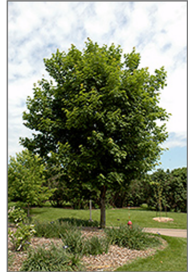
Sugar Maple

This tree should only be grown in full sunlight. It prefers to grow in average to moist conditions, and shouldn't be allowed to dry out. It is not particular as to soil pH, but grows best in rich soils. It is somewhat tolerant of urban pollution. This species is native to parts of North America.