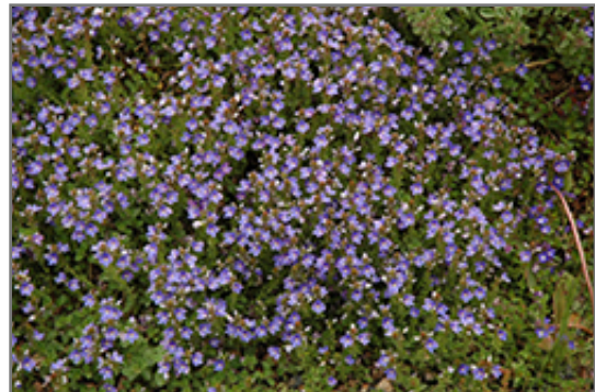
Turkish Speedwell in bloom

Turkish Speedwell is recommended for the following landscape applications;