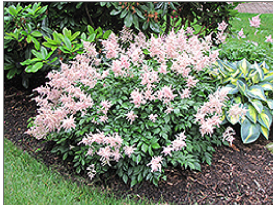
Peach Blossom Astilbe in bloom