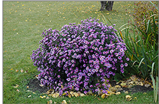
Purple Dome Aster in bloom